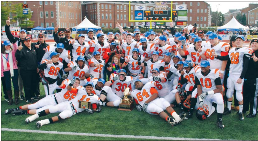
The South Pittsburg Housing Authority would like to congratulate the South Pittsburg High School football Pirates on winning their fifth state championship. They beat Jo Byrns High School 41-6 on Dec. 3.